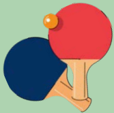
Table Tennis Come along for some table tennis. Friday Nights Maruia Hall 7pm