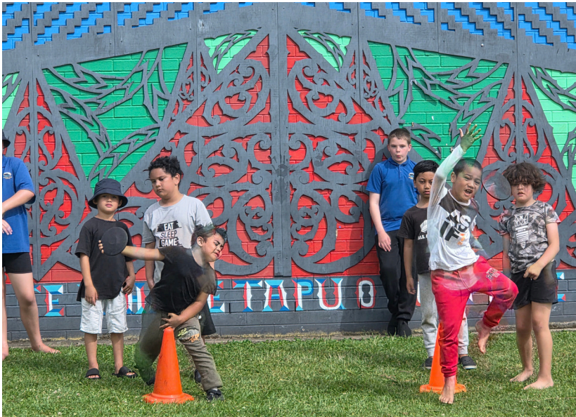
Athletics Day 2025