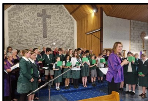
Totara College Singers 2023