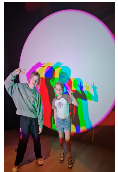
LC1 and LC2 space trip to Te Manawa