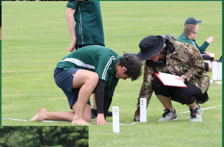
Great focus on getting the precise measurements.