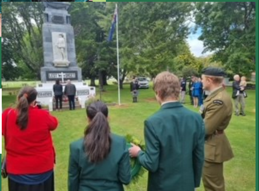
Our Leaders participating in Armistice Day.