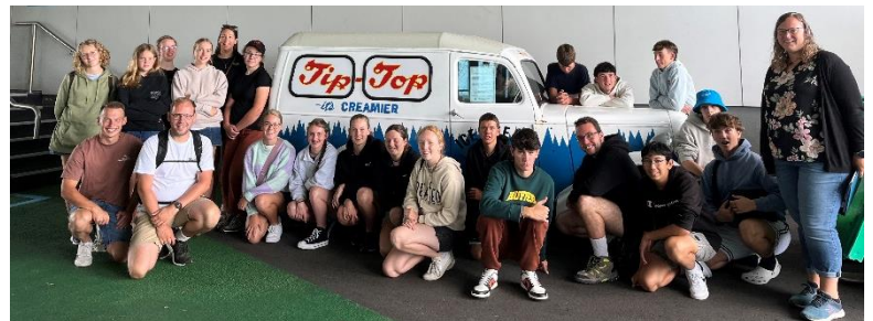
The senior students at the TipTop factory in Auckland