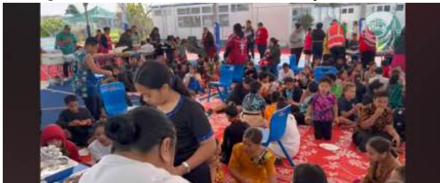
We finished an awesome week with a shared lunch. Food always makes people malimali (smile) 😊