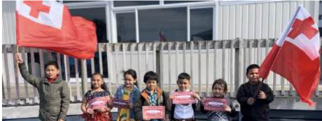
Some of our Top students during TLW from the Juniors