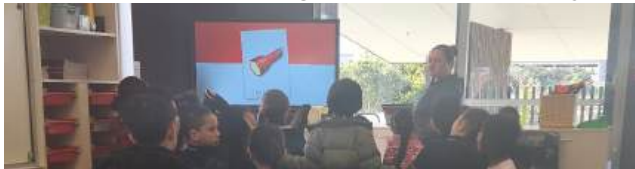
Maine Maru- Rm1 practice their Tongan words for the Quiz