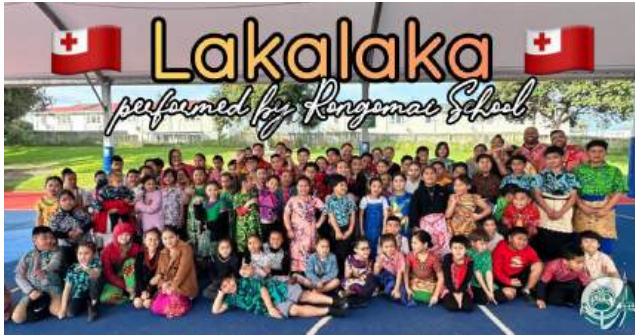
The whole school was involved in the lakalaka dance. Hover over the QR code right to witness the beauty!