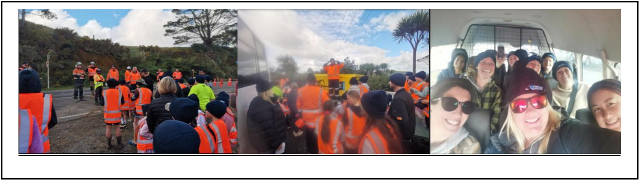
Nga mihi nui from the team at Awhitu District School