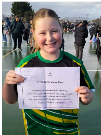
POD 31st May