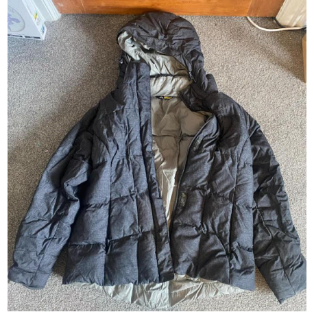
Macpac Puffer Jacket