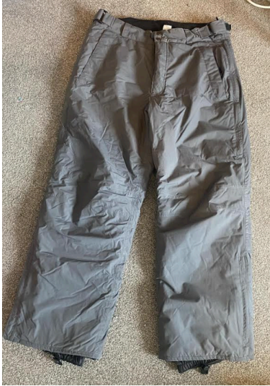
Grey Ski Pants

Jackets or pants reasonable offers between $20 - $40