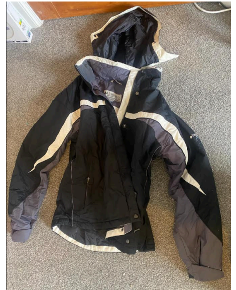
Columbia Black Ski Jacket