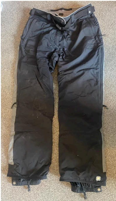
Columbia Black Ski Pants