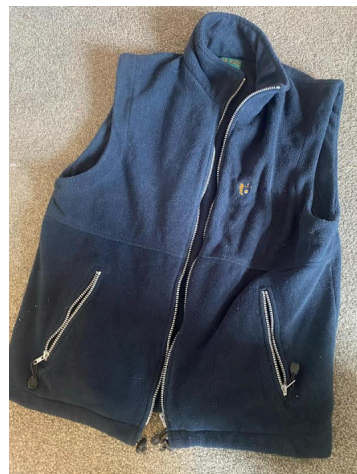
Ocean Blue Vest