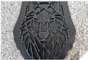
Wolf Head $5 (3 black in stock)