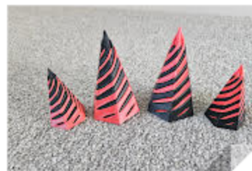
Cone Fidgets Small $8 Large $12 (Cone small 3 red over black & 3 black over red) (Cone large 4 red over black & 1 black)