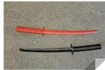
Swords $30 (1 red in stock; 1 black in stock)