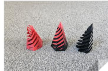
Small Cone Fidget $8