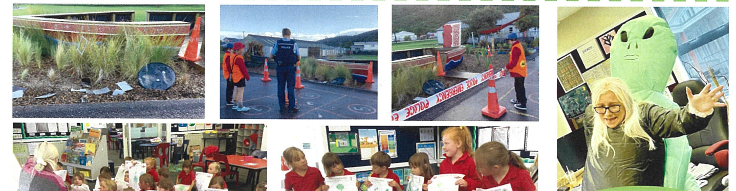
Security footage of the moment Mrs Markham was Abducted by Aliens.

Need a helping hand with cleaning? Koha-based cleaning services! I'm here to make your space sparkle! Whether it's a quick tidy-up or a deep clean, no job is too big or too small for me.