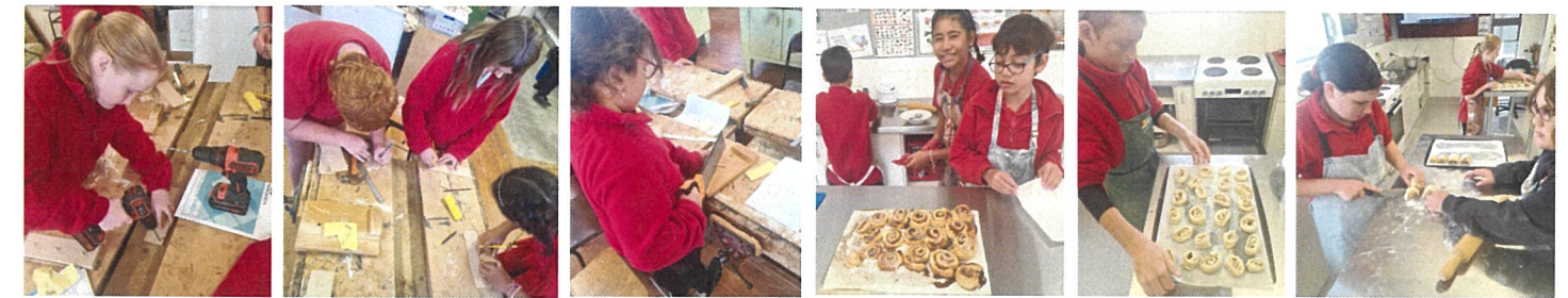
Year 7 & 8 students at Technology making a stacking puzzle in woodwork and baking pin wheel Scones in cooking.

Did you know? - school-aged children need between 10 and 11 hours of sleep per night. Support students to have a good night sleep; this will give them the tools to make positive choices during the day.