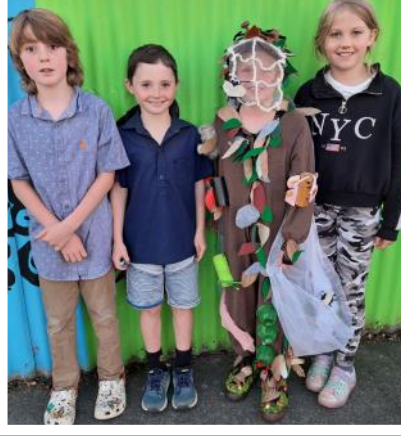
Students had an amazing time at the Wearable Arts held in Feilding last night. Well done to everyone who was involved!