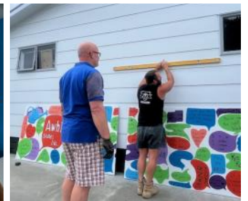
So many tasks taken care of at the working bee!