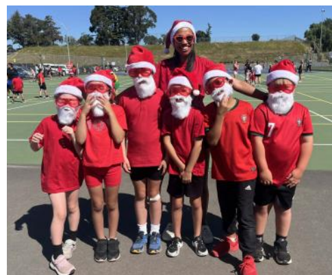
Congratulations to the Year 3/4 netball team, Hiwinui Lightning, who got through the season UNBEATEN! What a team of superstars you are!