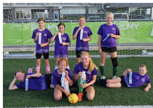
The Year 5/6 Summer Soccer team, Hiwinui Rebels, came away with "Champions" ribbons this season! Well done on placing first in your grade!