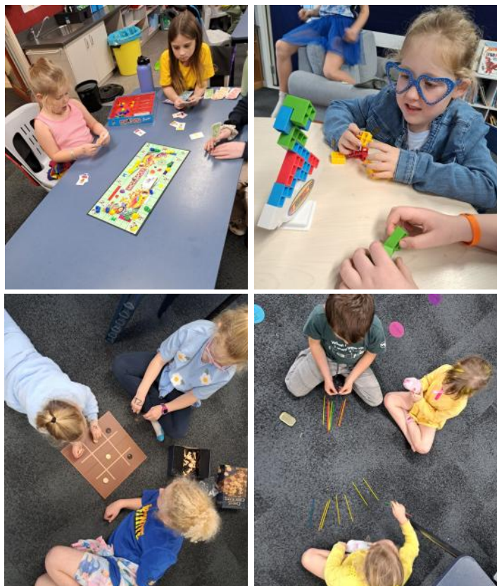
The rain kept us inside this afternoon instead of our planned school tabloids