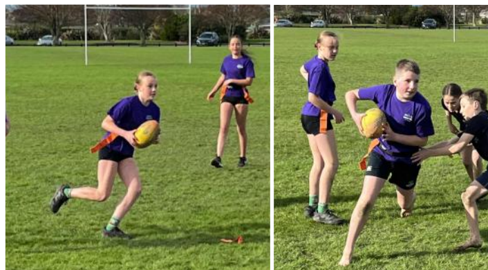
Rippa Rugby at Victoria Park, Feilding—what a great event! Well done to everyone who took part, and thanks to parents and whanau for your support.