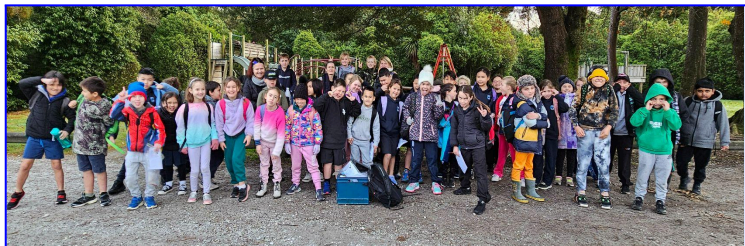
... and there's always a kid who's clearly done this before...