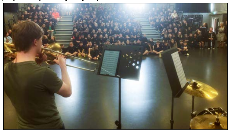
The player's POV: a completely engaged and attentive audience...

Supported by the Invercargill Licensing Trust; last week a sextet from the DSO toured fifteen southern schools: we were gig thirteen. Our kids loved the experience; they learned a little about each instrument; and genuinely enjoyed them being played very well by very capable musicians.