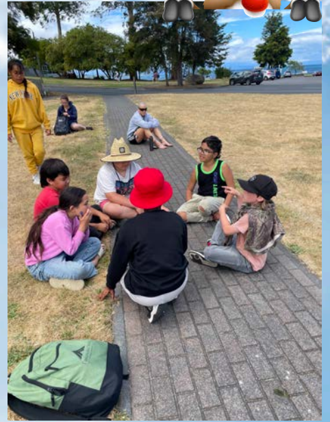
Waiting for our Boat to Arrive