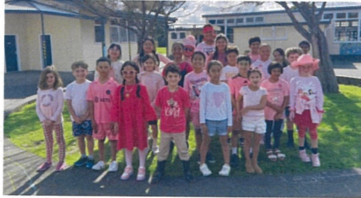
The Student Council