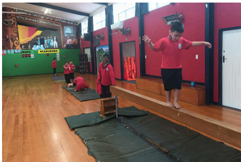
Teimania on balance beam

TP is diving, leaping and rolling into term 4. Check out our gymnastics mahi so far.