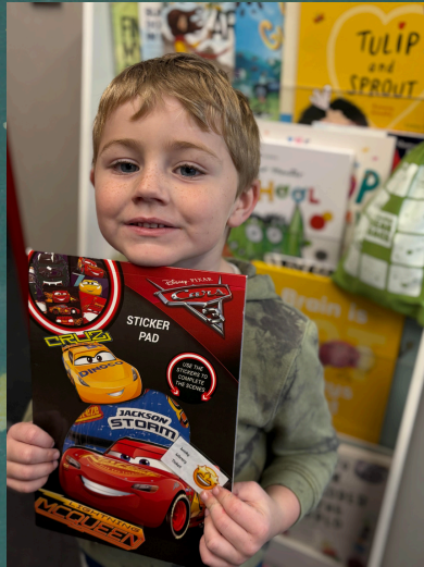
Jax's Lucky Library Ticket!