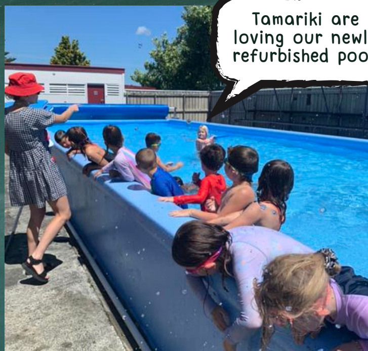
Tamariki are loving our newly refurbished pool!