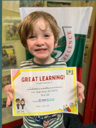
Otis - Amazing Vocabulary Choices in Writing!