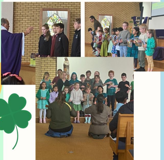
School and Parish St Patrick Mass