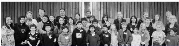
Reconciliation, First Communion and Confirmation 2024

Preparing And Celebrating Together Come & See Introduction Session Sunday April 7 After 9am Mass