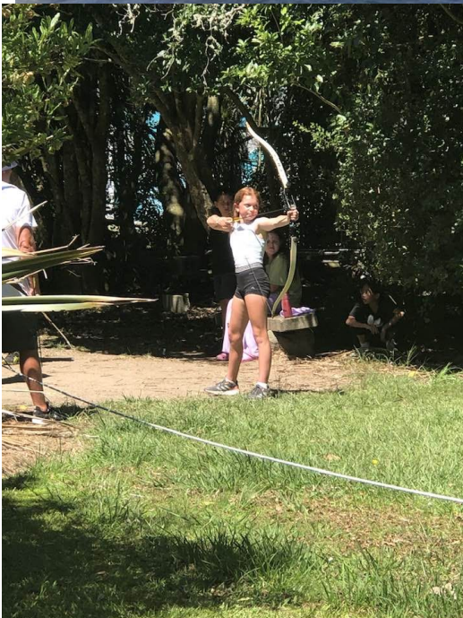
Lots of fun and action happening at the Year 5/6 camp. The children had a lot of fun and learnt to extend themselves out of their comfort zones. Thanks to the teachers and helpers who made the camp possible.