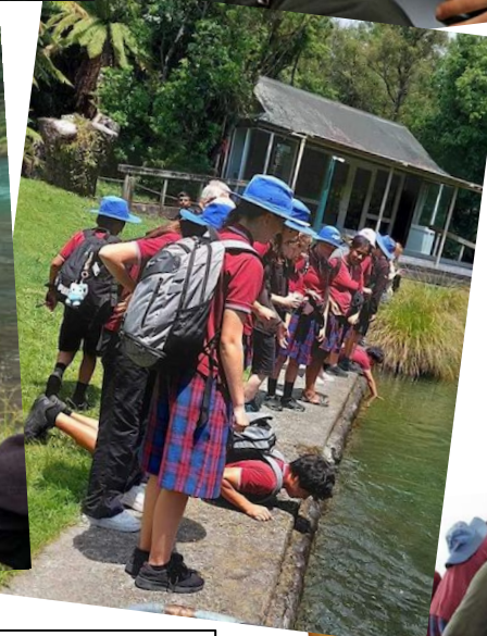
Toki hub travelled to Tūrangi last week to visit the Trout Centre as a culmination of their water study.