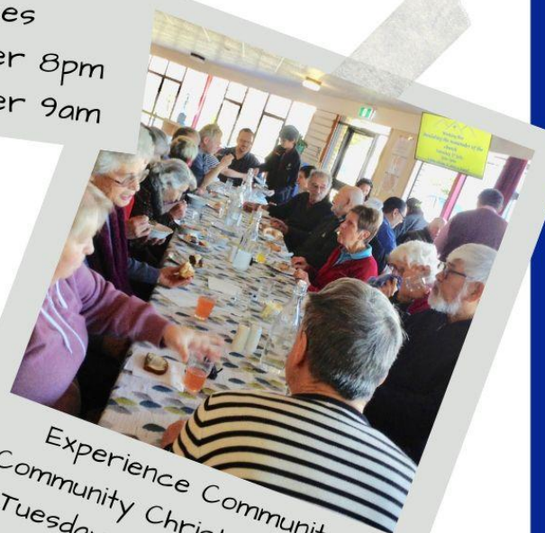
Experience Community Community Christmas Lunch Tuesday 12 December 1pm