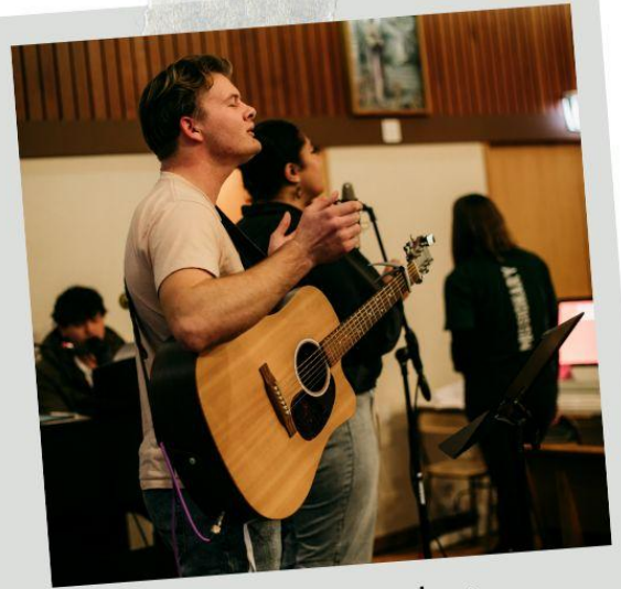
Experience Joy Praise and Worship Friday 15 December 6pm

Come along to one of these upcoming events and experience community, joy, peace and forgiveness. There are lots of ways for you and your family to be revived through our parish.