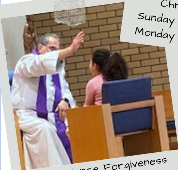
Experience Forgiveness Reconciliation Service Thursday 21 December 7pm