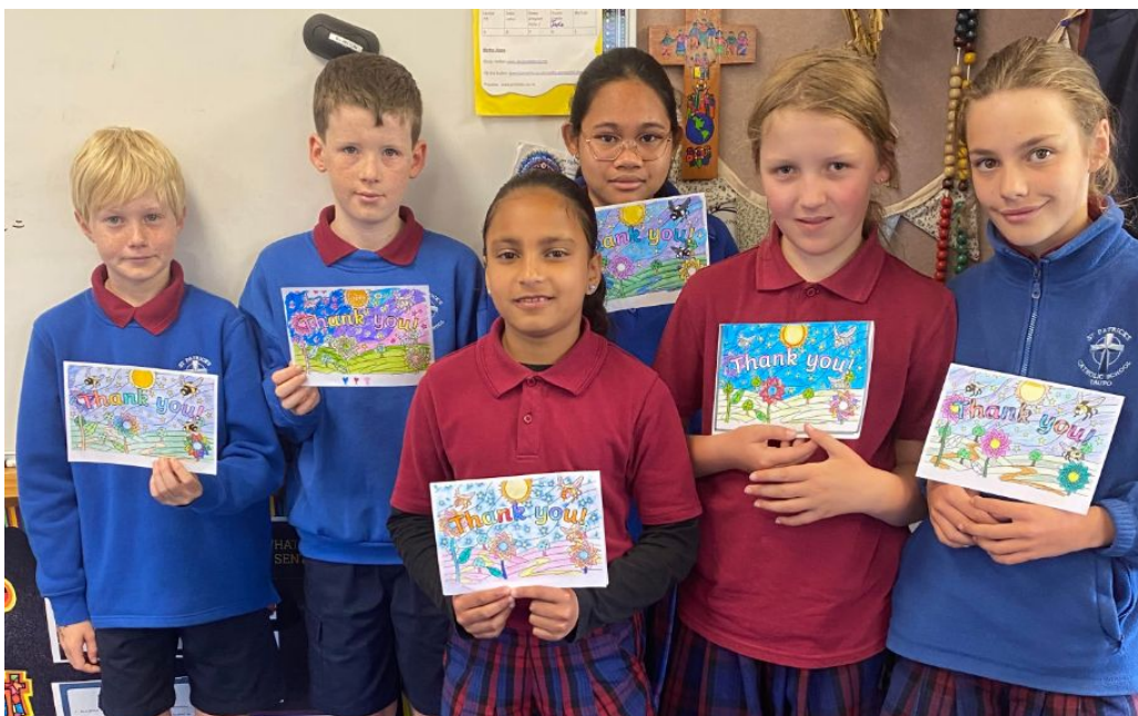
Room 10 pupils made cards to thank the Parishioners who made the wonderful Advent packs for our whānau.