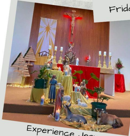
Experience Jesus Christmas Masses Sunday 24 December 8pm Monday 25 December 9am