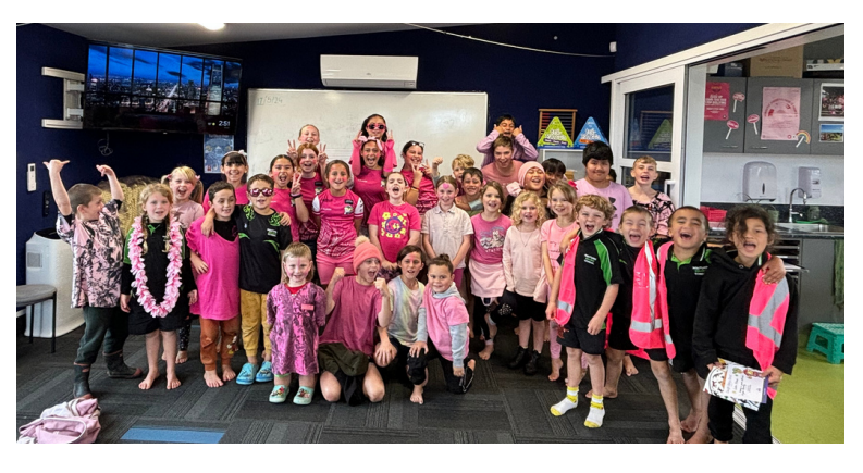
Standing up together against bullying on Pink Shirt Day