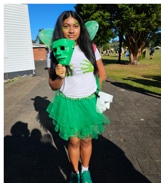
Check our College Sports Facebook Page for the link to more photos