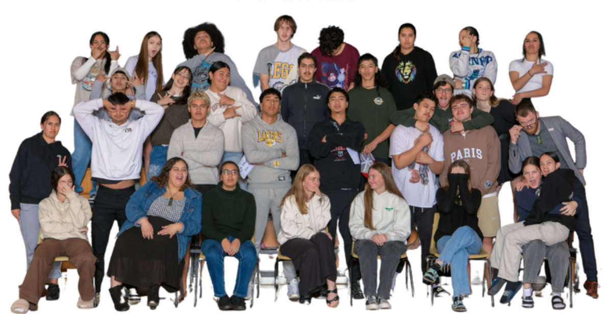
Empowering learners to succeed