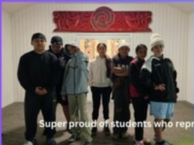
Super proud of students who represented our kura playing basketball, tag and power pulling, at the koroneihana games 2023. They did absolutely amazing!