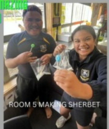
ROOM 5 MAKING SHERBET