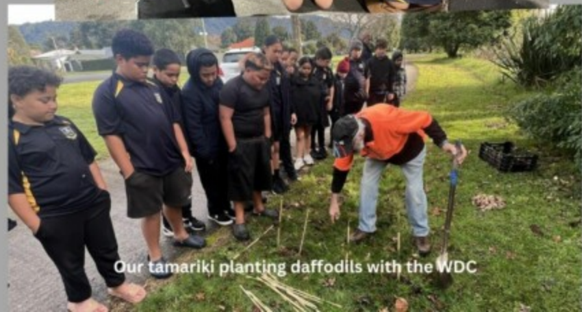
Our tamariki planting daffodils with the WDC