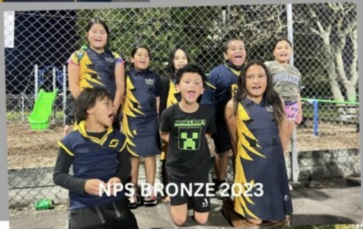
NPS BRONZE 2023