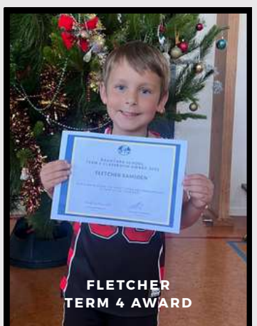
FLETCHER TERM 4 AWARD