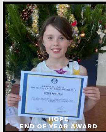
HOPE END OF YEAR AWARD