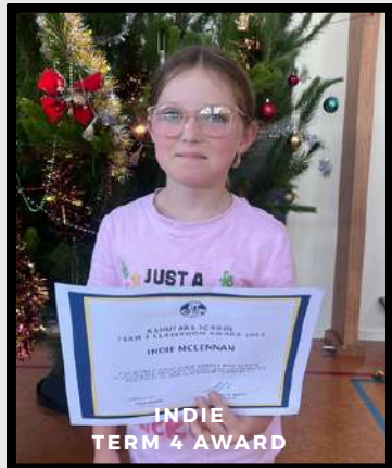
INDIE TERM 4 AWARD