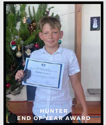
HUNTER END OF YEAR AWARD