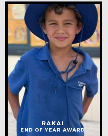
RAKAI END OF YEAR AWARD