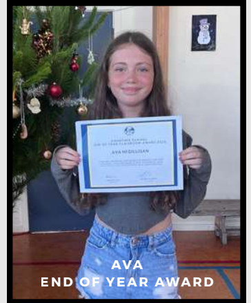
AVA END OF YEAR AWARD