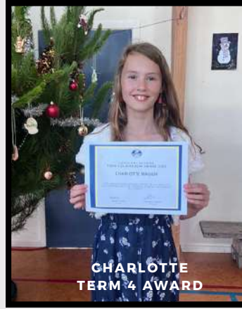
CHARLOTTE TERM 4 AWARD