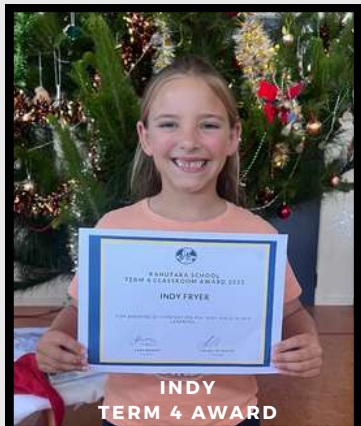
INDY TERM 4 AWARD