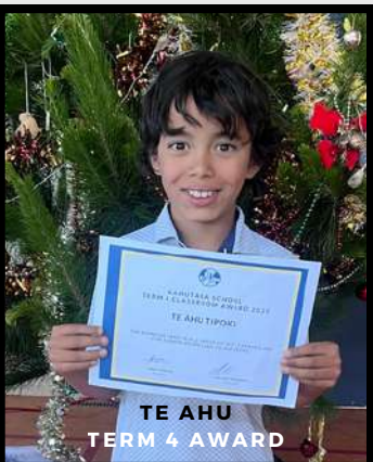
TE AHU TERM 4 AWARD