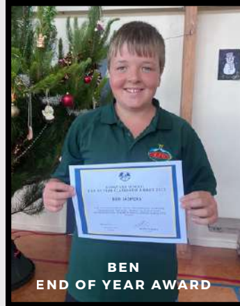
BEN END OF YEAR AWARD