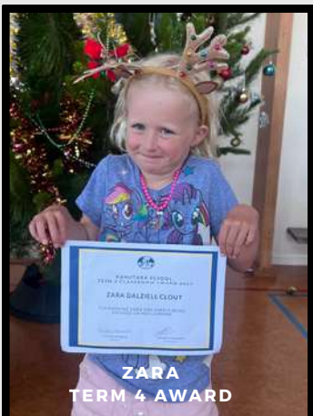
ZARA TERM 4 AWARD