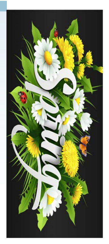
Is Just Around the Corner