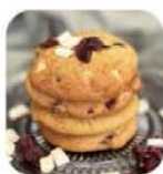
WHITE CHOC CRANBERRY