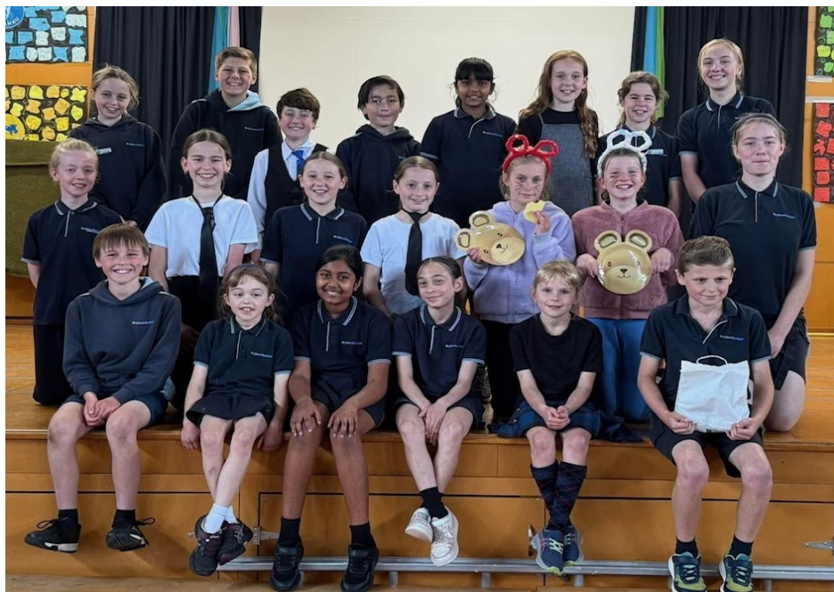
Salford's Got Talent finalists along with House Captains.